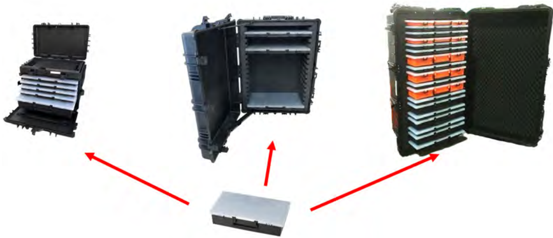
RED BOX 10840X